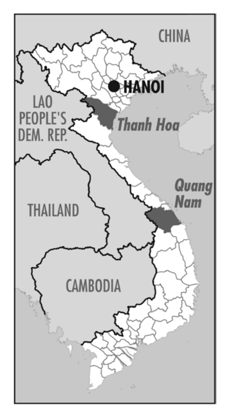
Figure 1. Location of pilot project

Sanitation marketing is the application of social and commercial marketing best practices to improve sanitation coverage