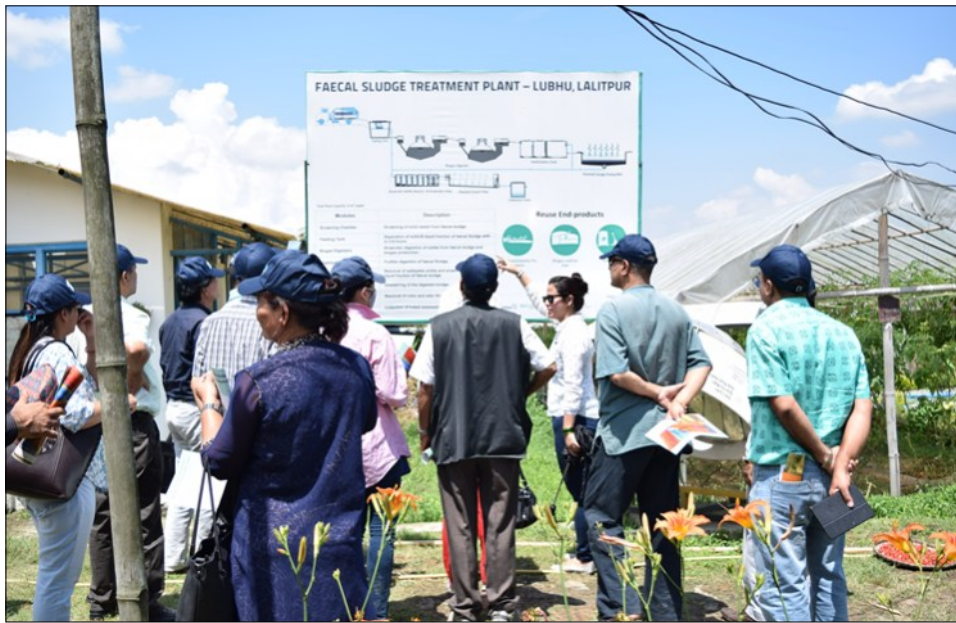
Guided Field Visit participants learning about the FSTP at Lubhu, Lalitpur

Moreover, a successful implementation model for faecal sludge management that represents the ideals of closing the sanitation loop via private sector engagement, in Kathmandu Valley, is the establishment of a Faecal Sludge Treatment Plant in March of 2016 at Mahalaxmi Municipality, Lubhu – Lalitpur. The Faecal Sludge Treatment Plant at Lubhu, is a pilot implementation with the consent of Mahalaxmi Municipality and support from ENPHO, BORDA, Saligram Bal Griha and CDD Society. The treatment plant is the first of its kind in Nepal with regard to the concept of reusability of all possible end products and integrated approach towards faecal sludge treatment, ultimately closing the sanitation loop. The faecal sludge treatment plant is a gravity based system and is capable of processing 6 m 3 of FS per week with relatively low operations and maintenance requirements – achieved via treating sewage in the absence of electromechanical equipment. Moreover, ENPHO is currently conducting feasibility studies, which will further optimize plant productivity and efficiency. The plant is already highly efficient and can be operated with minimal skilled labor on a day-to-day basis.