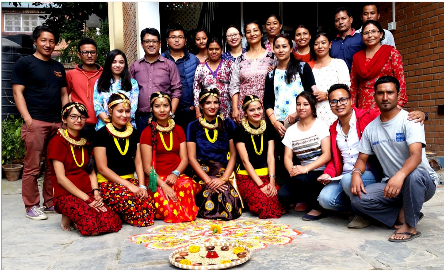
Paschim Paaila during the Deusi Bhailo - 2073 Program at Lumanti premises

The Deusi Bhailo program is a staple of Paschim Paaila's campaigns towards an epidemic free Nepal, since its first initiation in 2011. Initially, the funds raised in 2011 went towards general WASH campaigns in Kathmandu Valley. The events since then has been honed for specific causes. The funds supported the installation of a bio-sand filter in Pathibhara Tole, Chabahil, with a capacity of 2000 liters benefiting over 300 households in 2012. Furthermore, Paschim Paaila organized school WASH Campaigns in 10 school within Kathmandu Valley by utilizing the raised funds in 2013. Similarly, further contributions have gone towards the Prime Minister's Disaster Relief Fund for three consecutive years since 2014 and which also contributed to the relief efforts during the mega earthquake of 2015.