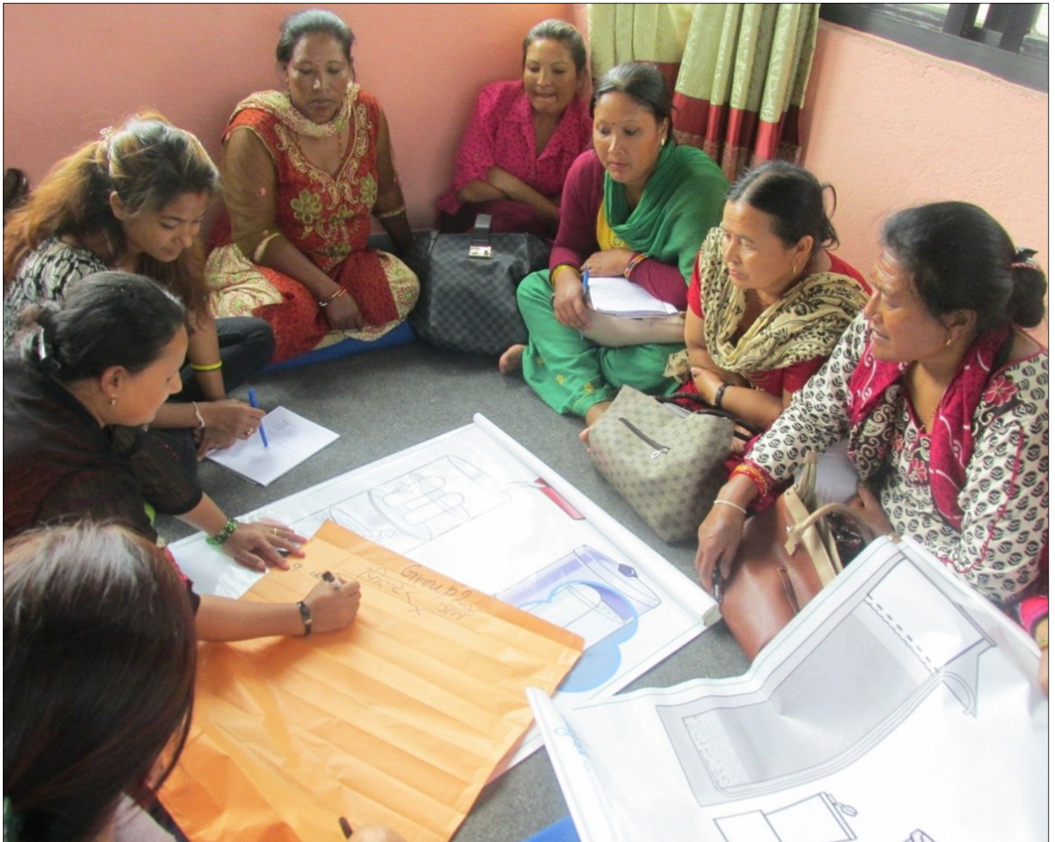
Participants actively engaged in group work regarding water treatment options during the WASH awareness campaigns at Lalitpur