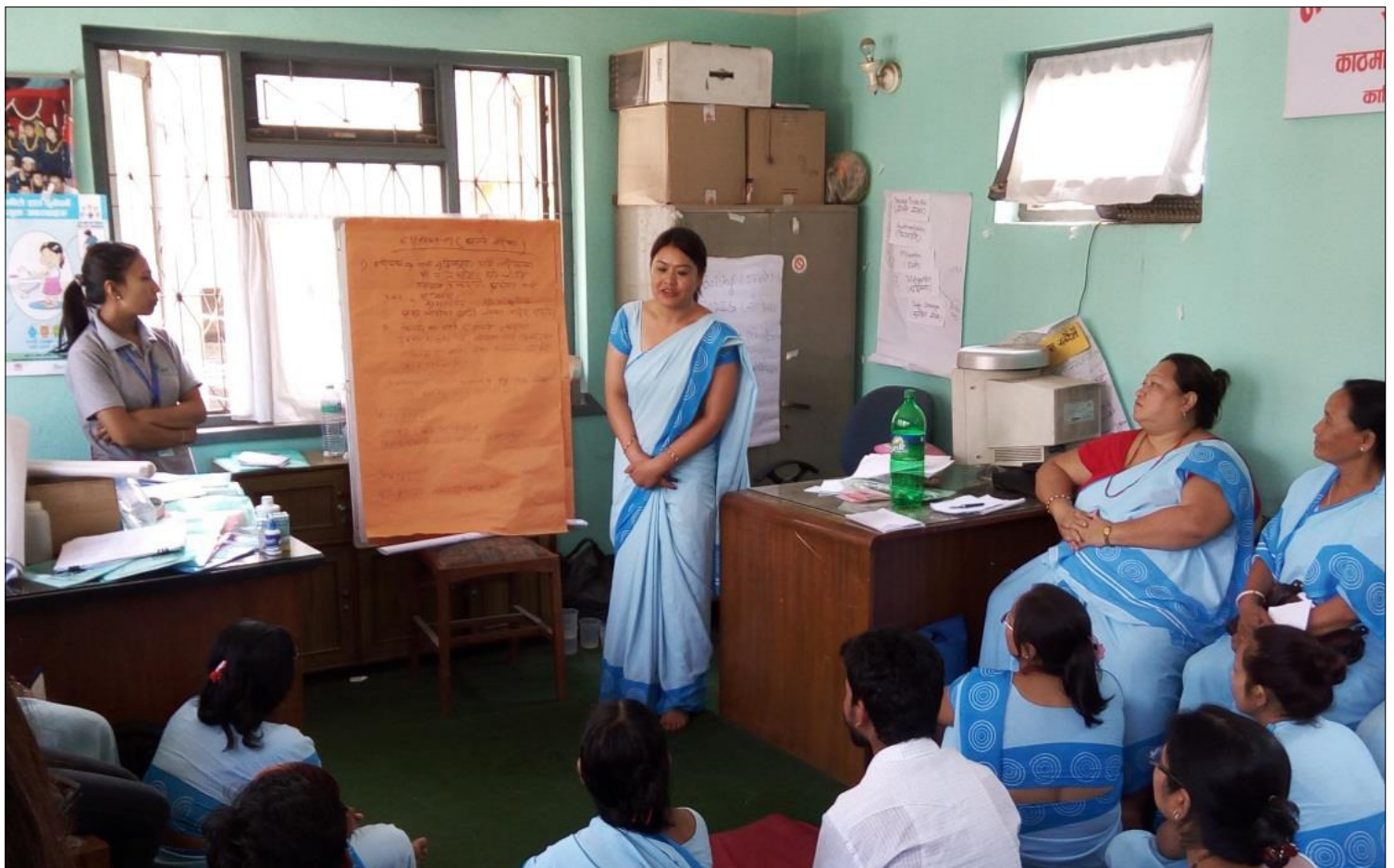
FCHV and Paschim Paaila volunteers reviewing WASH awareness campaign content prior to door-to-door awareness campaigns