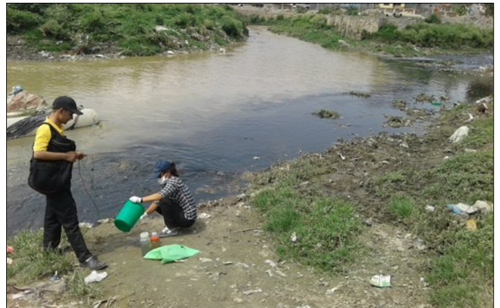
Water sampling of Manohara river during the National Sanitation Action Week - 2016

During the National Sanitation Action Week – 2016, ENPHO analyzed the water quality of Manohara River. The river exhibits relatively natural conditions upstream and anthropogenic disturbances downstream; agricultural runoff, riparian zone encroachment, sand excavation, effluent discharge and dumping solid and municipal waste. The maxima amongst 10 sample sites for total suspended solids, total phosphorous, total nitrogen, and potassium were beyond limits set by Nepal Government – Generic Water Quality Standard. One time sampling is not representative of an overall river water quality scenario. Annual water quality monitoring is planned for 2017.