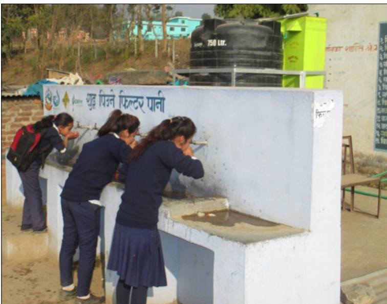
Few of the beneficiaries of the Support School for Improved Learning (SUSIL) Project

"Experientially, we take the many success factors and learnt lessons from every project and apply them in upcoming projects for replication and improvement. Recently, ENPHO initiated the SEEDS (Supporting Educational and Environmental Development in Schools) Initiative. In addition to developing other projects similar to the SUSIL Project, SEEDS Initiative, is an ENPHO's initiation employing SUSIL projects experiences to support the overall development of schools' education and environment."