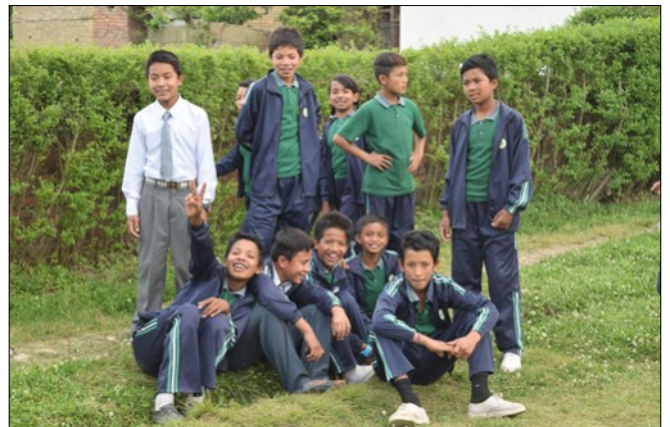
SEEDS Initiative Orientation (top right), Guided field visit to Tara Secondary School, Bhaktapur, for 10 runners of the Impact Marathon Series (top left), and Shree Shreekhanda Secondary School's students (bottom right and left)