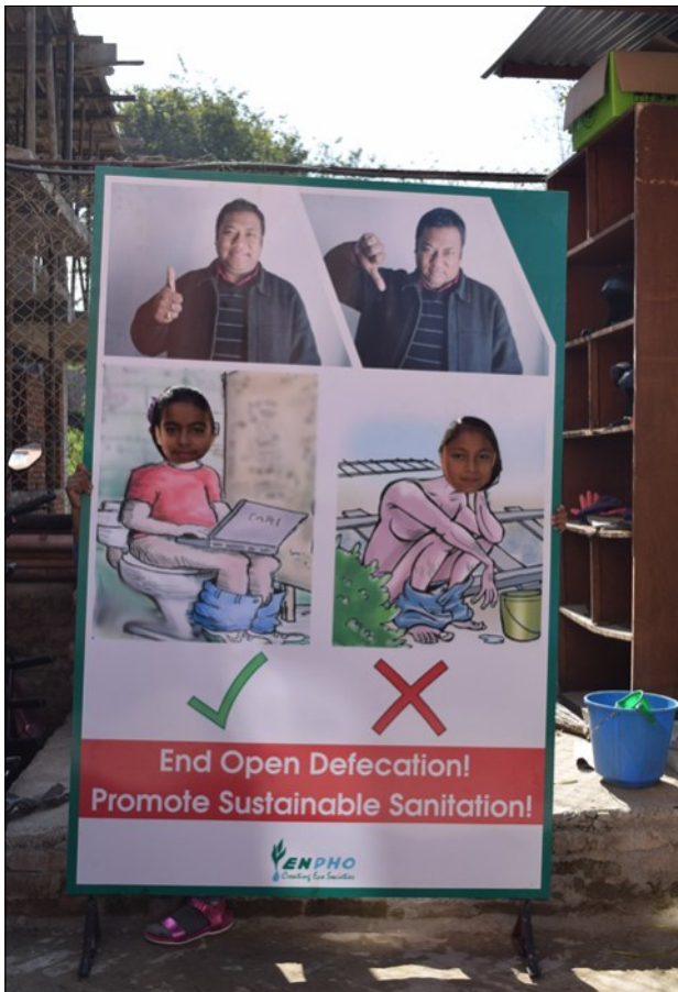
Participants at the Toilet Expo at ENPHO premises, New Baneshwor

The expo aimed to act as a sensitization tool for participants to recognize the importance of toilets and sanitation and additionally, help support the contributions made by private, government, and NGO's and INGO's, in the sanitation sector. Additionally, with the national target for the achievement of 100% sanitation coverage by 2017, demands for toilets have increased. Furthermore, the need to collaborate with the private sector has been realized to create linkages in urban centers and rural areas to aid the total sanitation coverage effort. In the spirit of partnership, ENPHO partnered with Parryware during the event. The expo was an attempt to create one of the first entry points as a platform for multi-sector cooperation, partnerships and private sector engagement .