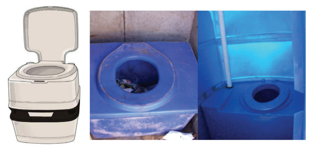
Figure 2 Portable flush (Zille, 2013), container and chemical toilets used in Cape Town

examples of non-sewered systems are shown in Fig. 2, (29 676 units), 95% or 28 144 of which need to be emptied and cleaned, weekly or oftentimes even more frequently (CCT, 2014). While this allows for centralised control, it also creates service backlogs at the WWTW given the sheer number of units that need to be emptied and cleaned, weekly or oftentimes even more frequently. The reliance on mainly on-site 'emergency' systems as an interim solution relates to attitudes expressed by multiple government officials interviewed, vacillating between acknowledging a responsibility to service informal settlements, needing to discourage their growth, and considering settlements as temporary until people are relocated to housing projects or the settlements are 'formalised' through in situ upgrading.